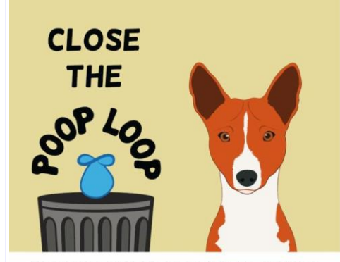
PICK UP AFTER YOUR DOG & TOSS IT IN THE TRASH.

The cities of Buellton, Carpinteria, Goleta, Guadalupe, Lompoc, Santa Barbara, Santa Maria, Solvang and the County of Santa Barbara's Project Clean Water are collaborating on a new pet waste campaign to Close the Poop Loop. The average dog produces 1/2 lb. of waste every day. In the City of Santa Barbara alone there are an estimated 22,500 dogs creating over 5.5 TONS of poop every day! When pet waste is left on the ground, it can quickly wash into storm