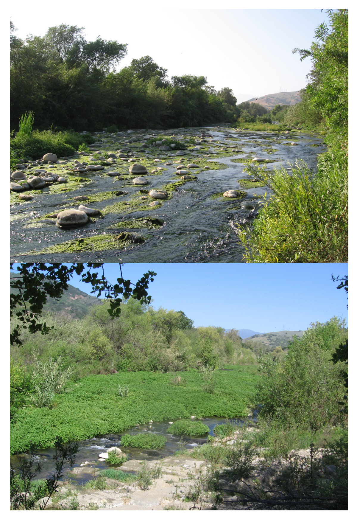
Figure 3 . Looking upstream from the Canada Larga confluence (just below the OVSD plant): May 20, 2008 above, April 4, 2009 below. Unfortunately, I have no matching 2008 photo, but I would still ask the same two questions. Assume, also, that we've seen the last major rainfall in 2009.