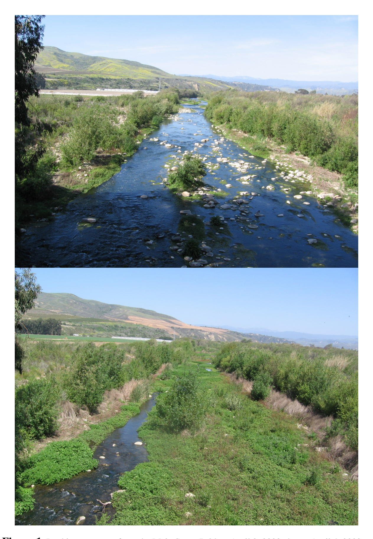
Figure 1 . Looking upstream from the Main Street Bridge: April 9, 2008 above, April 4, 2009 below. I would ask which year appears more likely to have a substantial algal bloom?