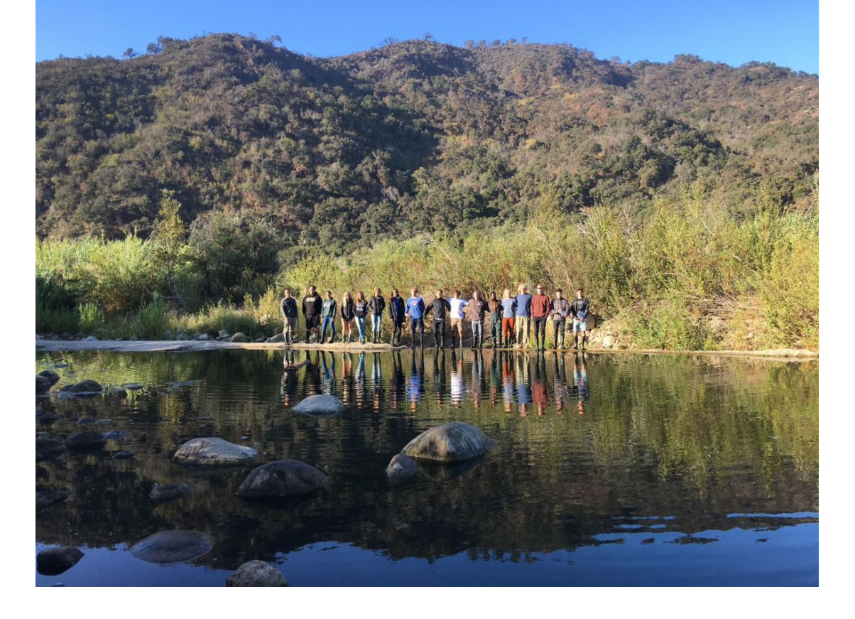
WORLD RIVERS DAY September 26

World Rivers Day provides an opportunity to celebrate our beloved waterways, recognize their value, and advance the stewardship of rivers. Rivers everywhere face an array of threats today and our very own Ventura River is in peril.