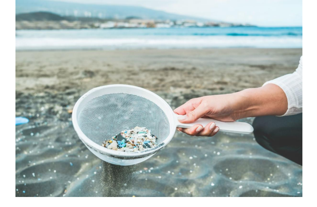
WATERSHED BRIGADE'S MICROTRASH CHALLENGE September 18th

We hope you'll join us for the Microtrash Challenge at West Beach on Saturday, September 18th from 9:00 am to 12:00 pm!