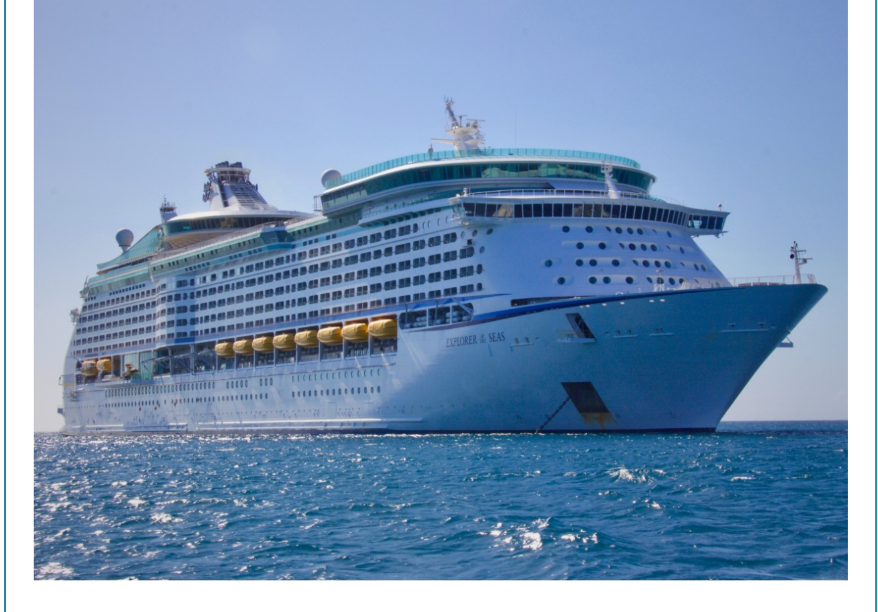
SANTA BARBARA HARBOR COMMISSION'S CRUISE SHIP SUBCOMMITTEE MEETING August 22

The Harbor Commission's Cruise Ship Subcommittee will meet on Tuesday, August 22nd to review and reconcile recommendations from the City of Santa Barbara's Waterfront Department, Santa Barbara Channelkeeper, the Channel Islands National Marine Sanctuary Advisory Council, and others. The public is welcome to attend.