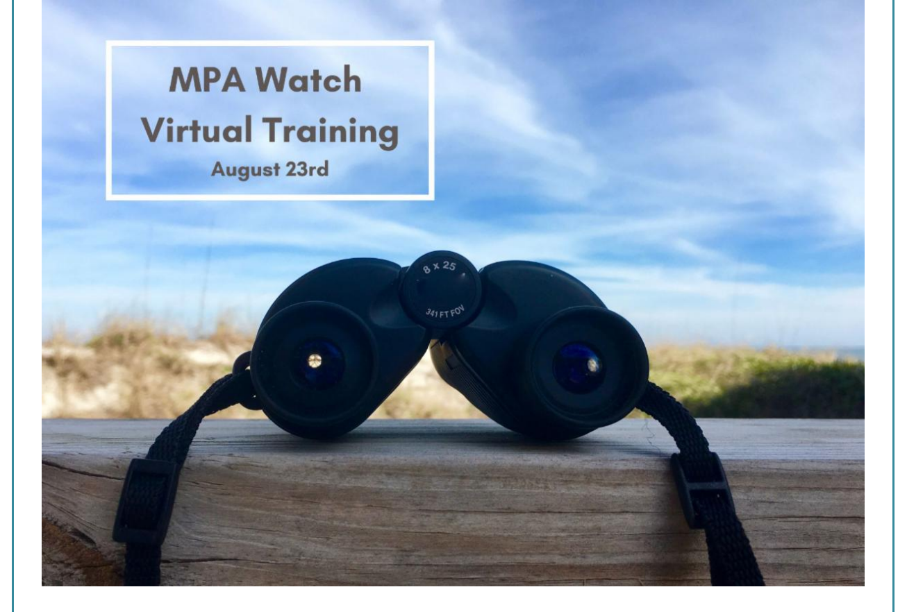
BECOME AN MPA WATCH VOLUNTEER August 23

Channelkeeper's MPA Watch program conducts surveys of human use activities in our local marine protected areas (MPAs) at Campus Point MPA (IV/Goleta), Naples MPA, and Kashtayit MPA (Gaviota State Beach). The data collected helps to inform MPA monitoring and enforcement efforts. Surveys involve walking a designated transect along the beach at the MPAs mentioned above and recording all human use activities observed on the beach or just offshore. Volunteers are asked to conduct just 3 surveys per month.