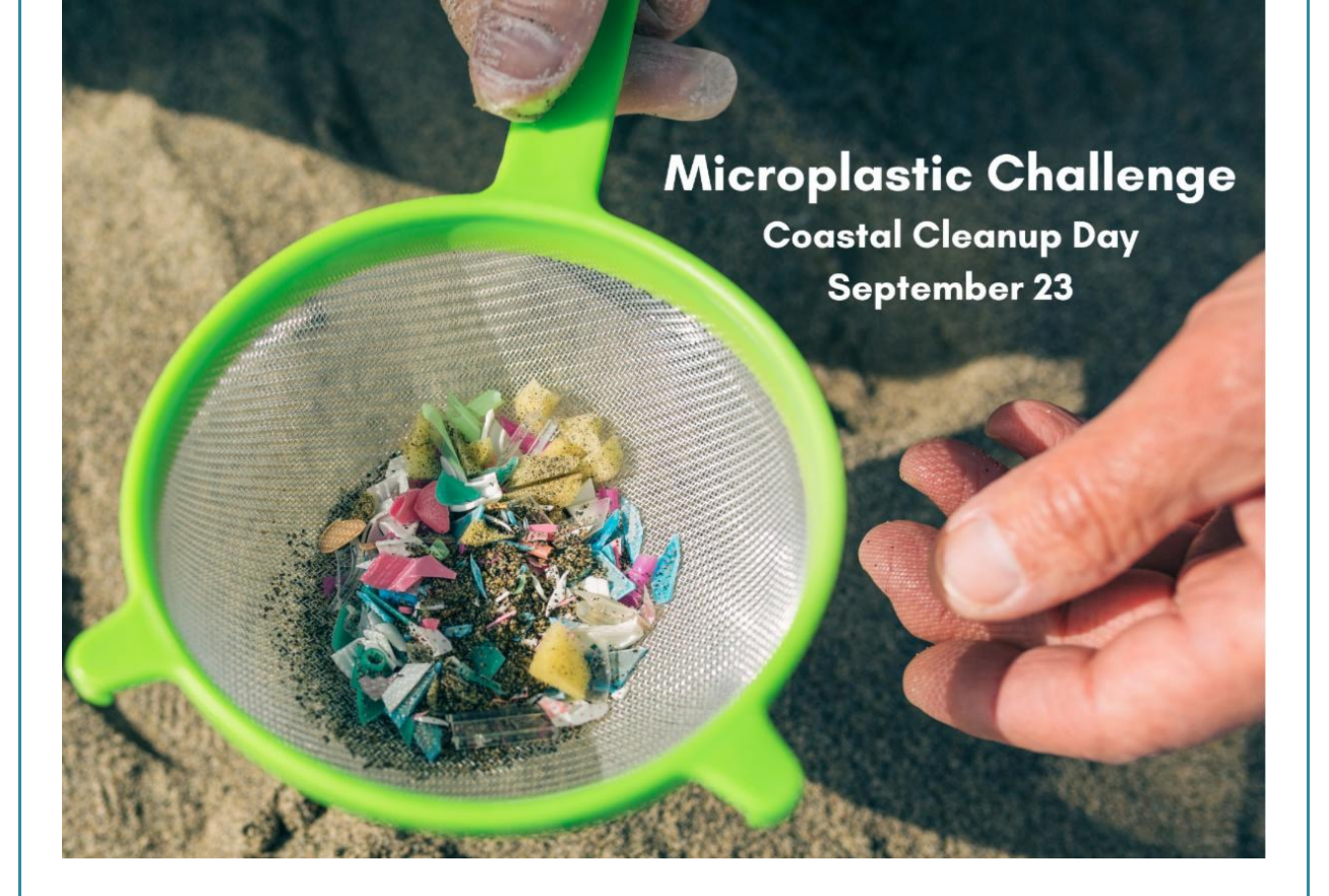
SAVE THE DATE: WATERSHED BRIGADE'S MICROTRASH CHALLENGE ON COASTAL CLEANUP DAY - SEPTEMBER 23

We hope you'll join us for the Microtrash Challenge at West Beach on Saturday, September 23rd from 9:00 am to 12:00 pm!