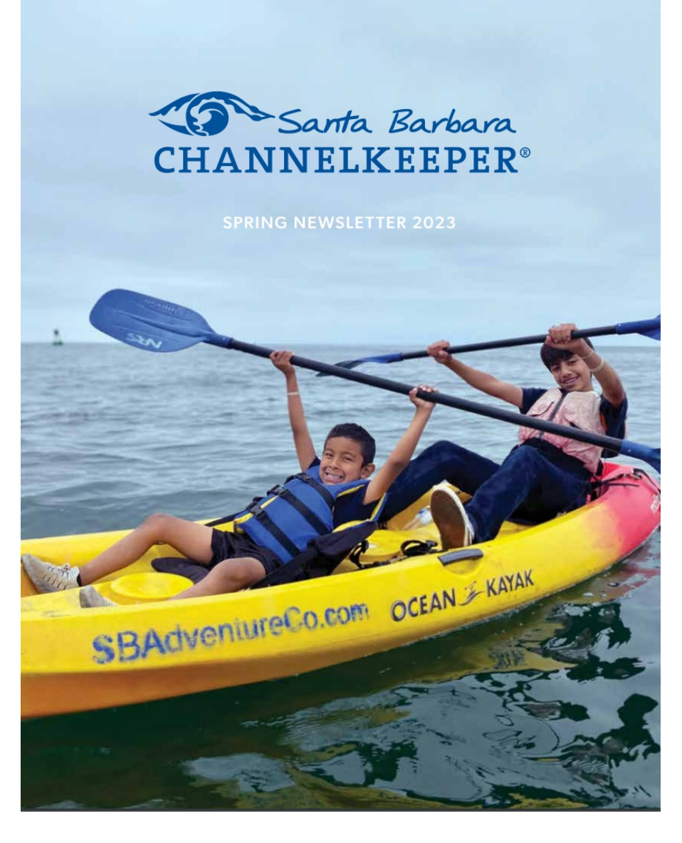
ENJOY THE SPRING/SUMMER 2023 NEWSLETTER ONLINE

We're pleased to share that Channelkeeper's Spring/Summer 2023 newsletter is now available online. Dive in! Explore the underwater architecture of Naples Reef and the benefits of marine protected areas. Discover the fundamentals of Channelkeeper's recommendations for the City of Santa Barbara's cruise ship program. Join us in celebrating the success of the Blue Water Ball, our latest community cleanups, and our work to inspire the next generation of environmental leaders through educational experiences!