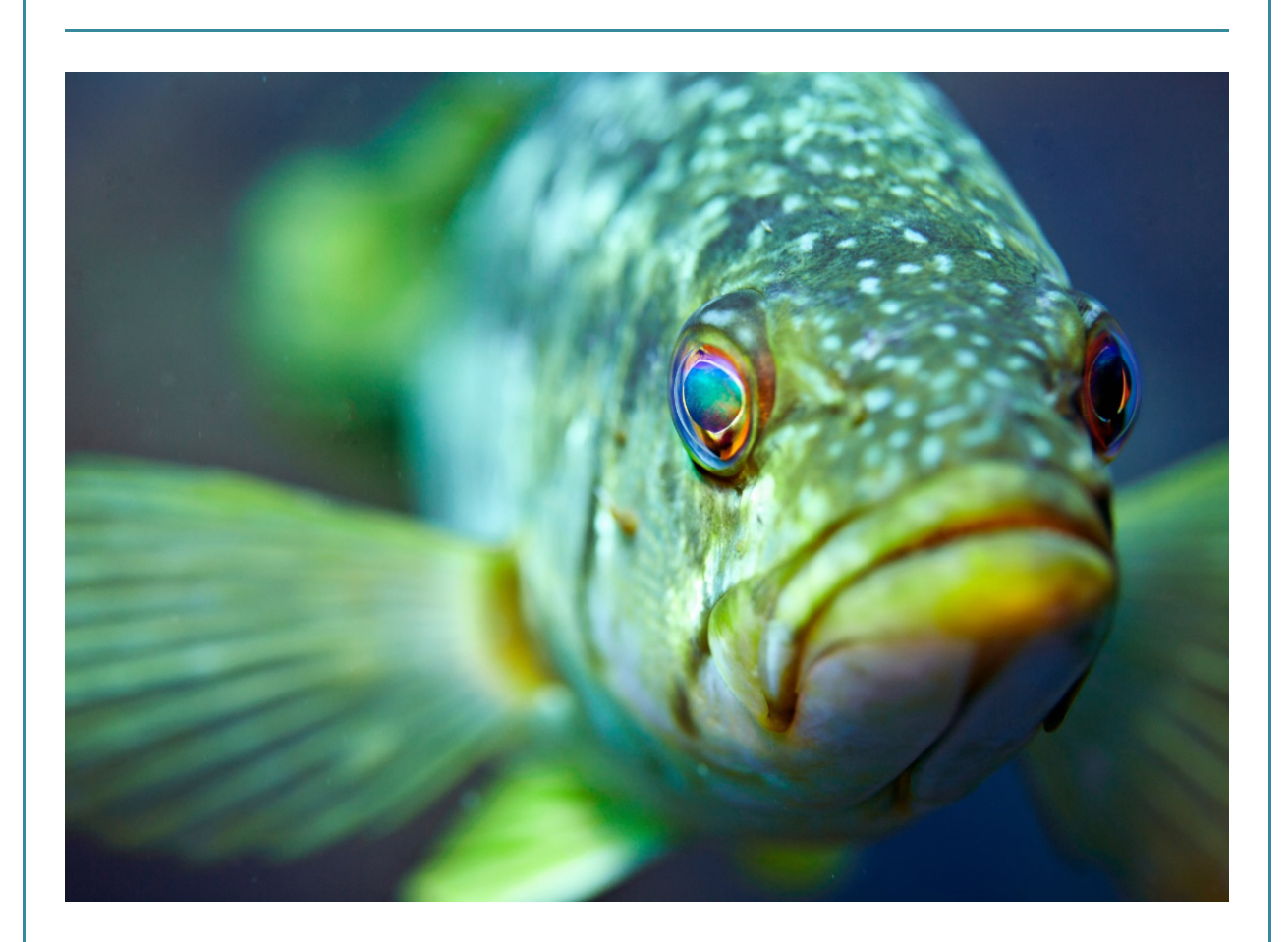
SUPPORT CLEAN WATER

The walk includes a moderate climb on a dirt trail. Participants should wear sturdy shoes and bring a hat, jacket, water, and sunscreen. We look forward to seeing you on Saturday, February 24, 9:30 am. We'll wrap up around noon.